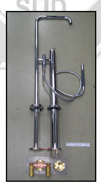
Photo 1. Free Standing Bathtub Faucet (with hand shower) Model: FS1